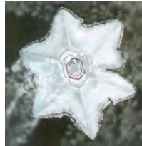
(Kawachi folk dance music)

Classical or soothing music form beautiful crystals, as do the words "thank you, love, joy, peace, Mother Teresa, Jesus and Gandhi." Evidently, the two most important emotions that form these beautiful crystals in water are love and gratitude used together. Isn't that interesting? H 2 O is like two Helpings of gratitude and a heap of Organic-love .