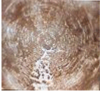
(Heavy metal music water)

Music, names of people, words, prayer and other conditions were used to test the outcome of the water's properties on many different occasions. His research showed that heavy metal and rock music, the name "Hitler" and word phrases such as "I want to kill you" or "I hate you," prevented crystallization and gave the water a murky look.