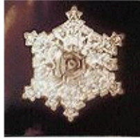
(Beethoven classical music water)