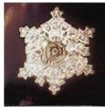
(Fujiwara Dam after a prayer)