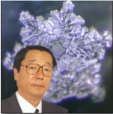
Dr. Masaru Emoto

Throughout the ages, it has been an accepted custom to bless our food before we eat. Did we ever really know the significance of the blessing as we held hands in gratitude, with rumbling tummies? Visionary researcher from Japan, Dr. Masaru Emoto, conducted extensive research of water and “accidentally” found that our attitudes – especially “gratitudes” – can affect the quality of water inside and outside of our bodies. Since our bodies are made up of over 70 percent water, I think this research speaks to all of us.