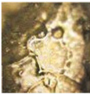
(Dirty river water)